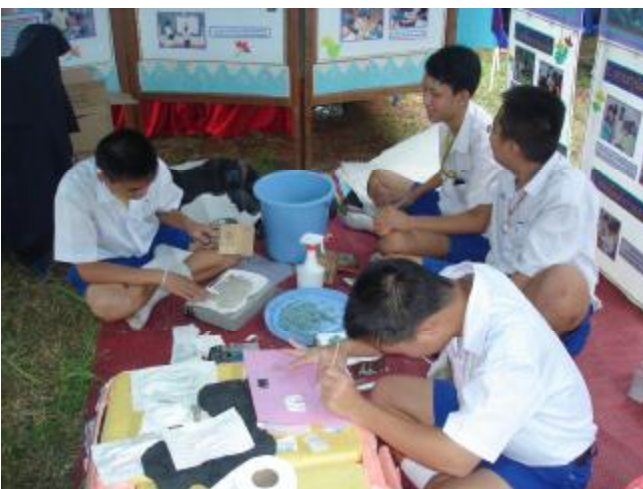
The products from recycle paper